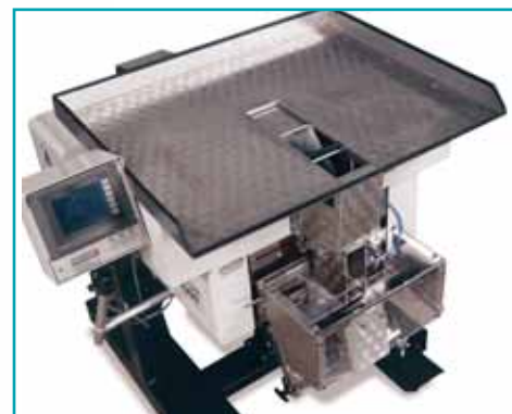
Shown here with T-1000 Advanced Poly-Bagger