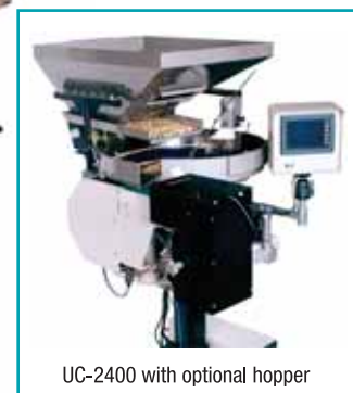
UC-2400 with optional hopper